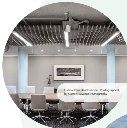
Hickok Cole Headquarters