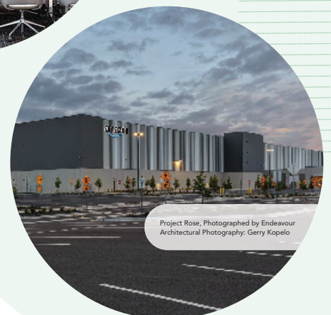
Project Rose